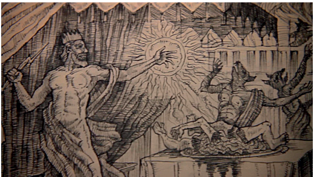
Figure 2 a) King Lycaon, with the trick feast for Zeus, as depicted in an image from Gerard Argent's bestiary; b) Zeus transforming Lycaon and his sons into wolves and destroying the palace with thunderbolts, as represented in the Argent bestiary ( Teen Wolf , 'Visionary' [season 3, episode 8], 23:32–23:35).