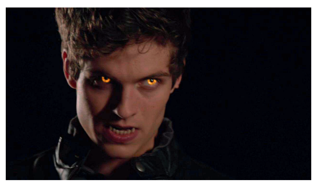
Figure 3 Isaac Lahey (Daniel Sharman), a secondary character in the early seasons of the show. His eyes glow yellow even while not fully shifted, indicating he is a beta werewolf who has not taken an innocent's life. ( Teen Wolf , 'Venomous' [season 2, episode 5], 36:01).

the supernatural beings that allows them to change back into their human form, restoring their humanity, a conscious inversion of Pliny's proposal.