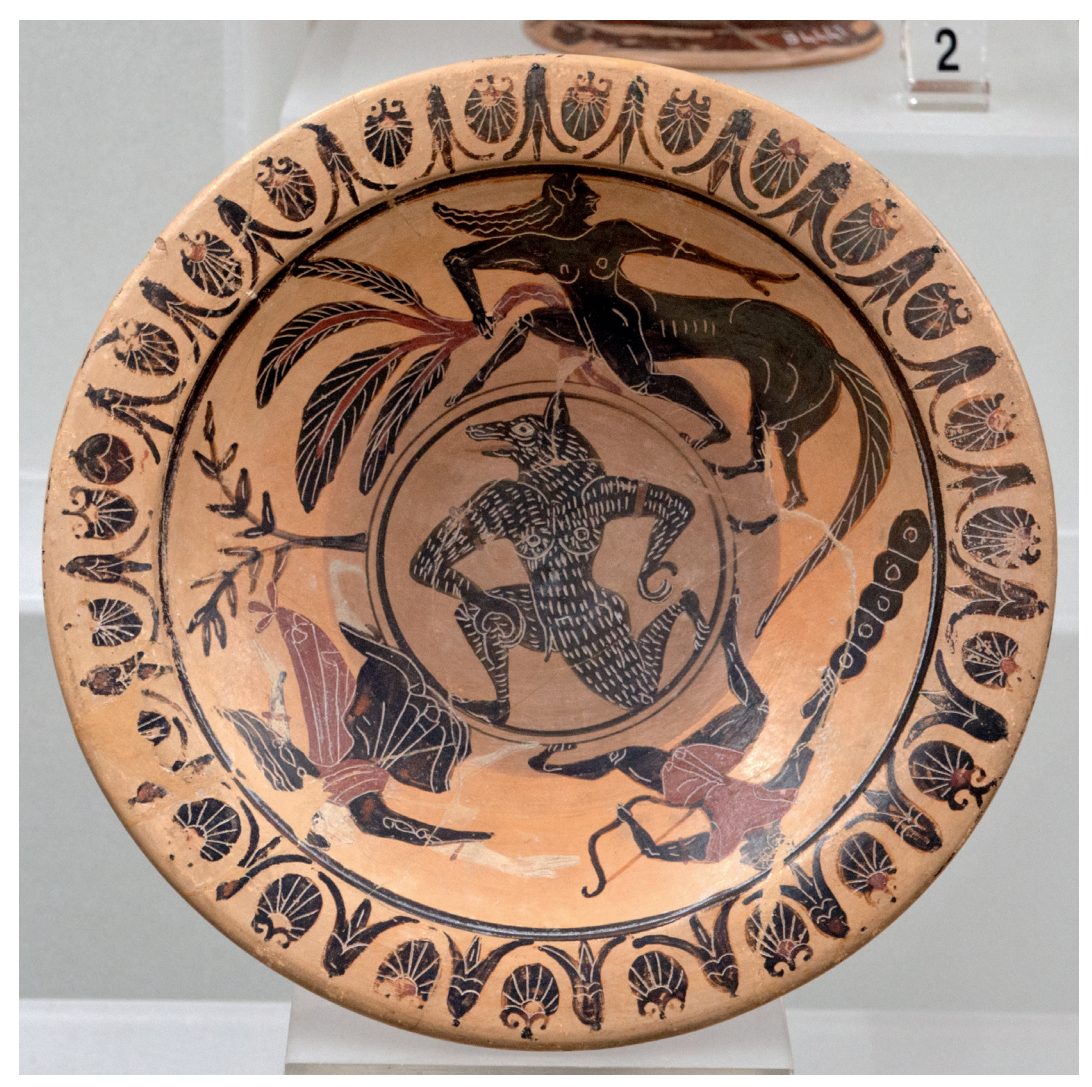
Figure 4 Etruscan Black Figure Plate with the wolfman (centre) and Herakles pursuing the centaur Nessos in the presence of Deianira (sides). Found at Vulci, Osteria Necropolis, Tomb 177 (Hercle Society excavations), ca. 540–510 BCE, currently in the Museo Nazionale Etrusco di Villa Giulia, Rome.