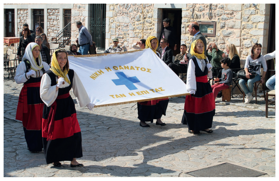
Figure 3 17 March celebration in Areopolis.

The Origins and Evolution of Ancient Spartan Identity in the Mani Peninsula