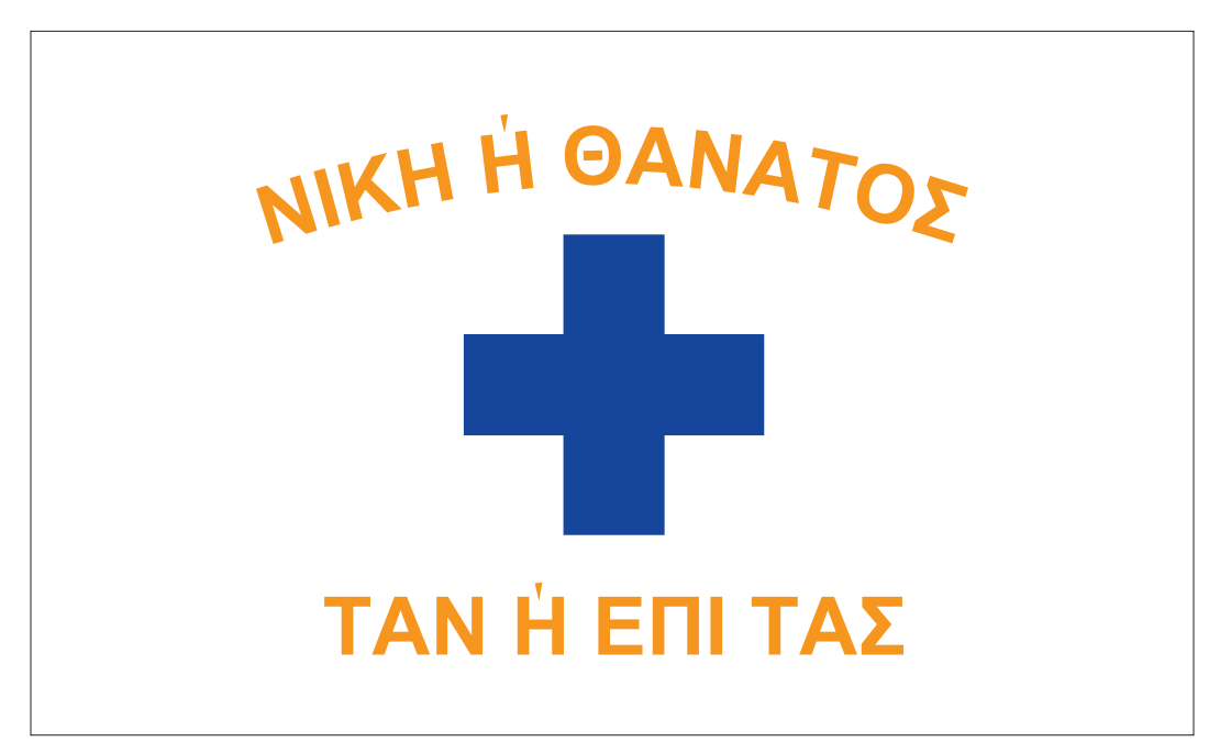
Figure 2 Drawing of the Maniot Flag. Image Source: Wikipedia (https:// commons.wikimedia.org/wiki/File:Mani_Flag_(Greece).svg) Attribution: Yaddah/Public Domain, 2005.

Greek revolutionary flags from the 18^{th} century onward),<sup>39</sup> the Maniot flag differed starkly from other revolutionary flags at the time in the words printed above and below the cross: above, "NIKH 'H \Theta ANATO \Sigma " ("Victory or Death"; in contrast to the "Freedom or Death" motto proclaimed elsewhere, since Mani was already considered free) and below, "TAN 'H EIII TA \Sigma " (Figure 2). As mentioned above, the latter motto is a quote from Plutarch ( Moralia 241 f), and is usually understood to mean that retreat from battle was simply not an option. Rather, both ancient Spartan men and the modern Maniots—in contrast to the other Greeks were expected to return home from war either victorious or not at all.<sup>40</sup> By plac-