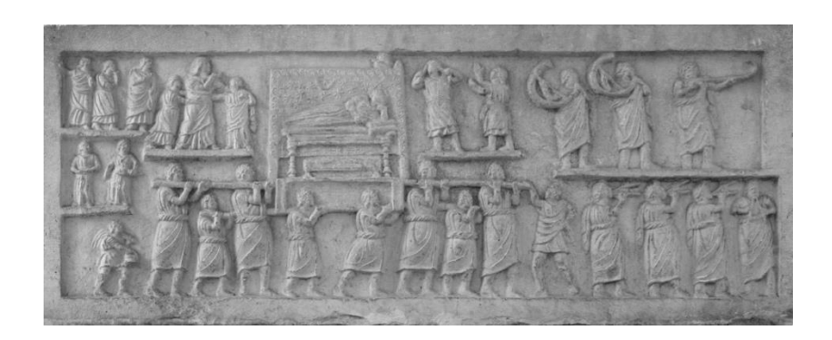
\label{eq:convergence} \textbf{Figure 2.} \ \ \text{Funerary relief from Amiternum, c.50 BCE.}